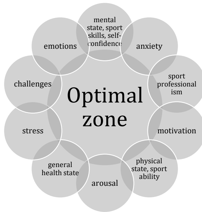
Figure 1: Components of the optimal zone level (according to Kiss-Balogh's, Balogh's, Hebb's, Hardy-Parfitt's, Hanin's & Robazza's review)